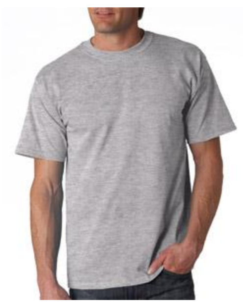
Sport Grey (90/10)