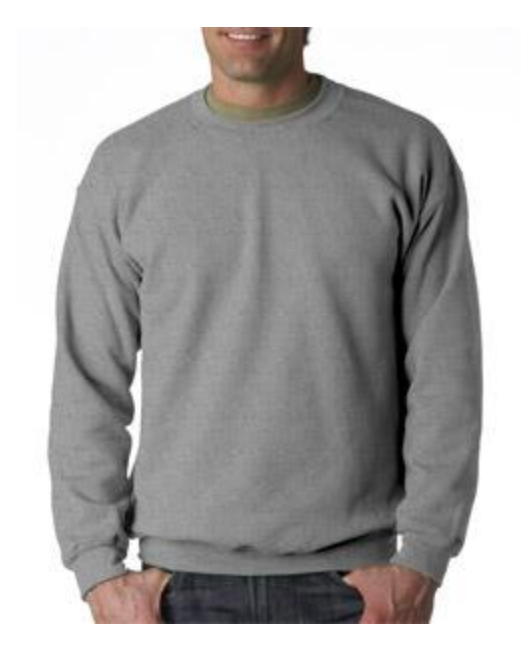
Sport Grey (50/50)

S-5XL: Antique Cherry Red (50/50), Antique Sapphire, Ash (50/50), Black, Carolina Blue, Charcoal, Cherry Red, Dark Chocolate, Dark Heather (50/50), Forest Green, Gold, Heliconia, Honey, Indigo Blue, Irish Green, Kiwi, Light Blue, Light Pink, Maroon, Military Green, Navy, Orange, Paprika, Purple, Red, Royal, Sand, Sport Grey (50/50), Violet, White